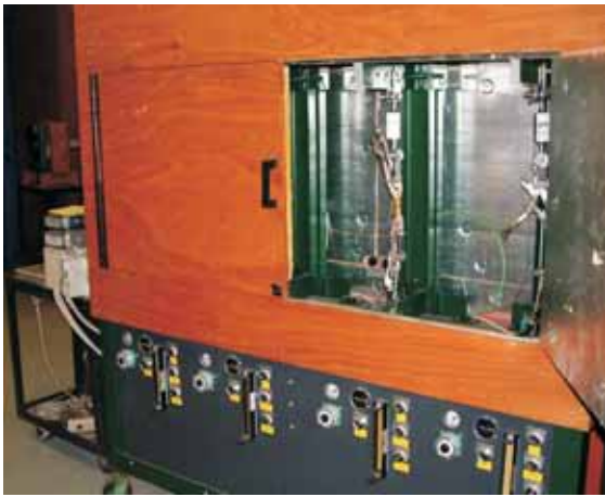
Figure 2—The new Creep Stress Test Machine

Beam Test showed good correlation. This new test provided a data point every 24 hours.