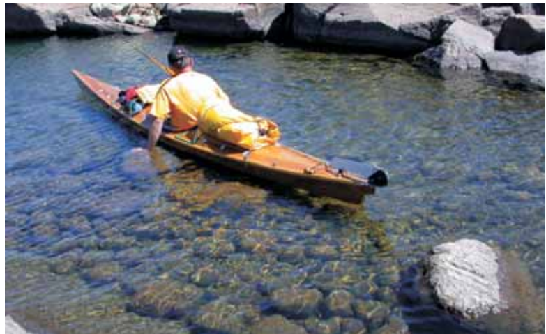
Somewhere in the Fox Islands chain in Georgian Bay. Submerged rocks below crystal clear water make a great backdrop for this 17' Endeavour kayak.