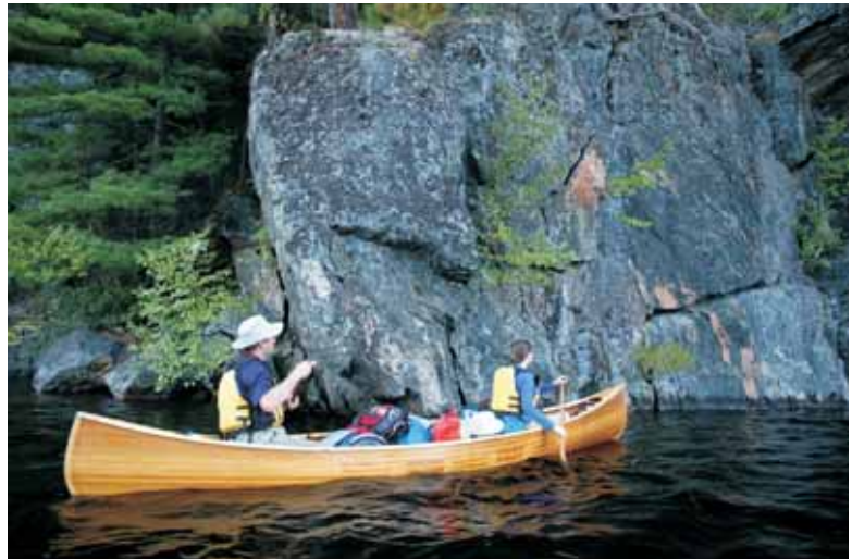
One reason people build boats is that they give you the opportunity to find beauty in otherwise inaccessible places. Paddlers in a 16' Prospector check out an amazing faulted rock formation in northwestern Quebec, September 2008.