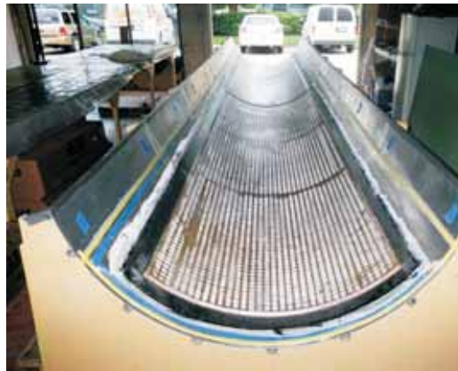
The cured outer carbon skin with foam core.