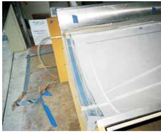
A panel curing under vacuum. The panel was built of 1/2"-thick Divinycel foam between layers of 6 oz carbon fiber cloth laminated with WEST SYSTEM® Epoxy.

The panel construction consisted of 6 oz plain weave carbon fiber cloth on each side of 1/2"-thick H-80 Divinycel contour core foam. We started the layup with nylon release fabric against the mold, then used squeegees and roller to wet out carbon fiber cloth. The foam core was precut to dimension and coated with a light mixture of epoxy and 407 Low-Density Filler to fill the surface voids. We transferred the wet foam onto the carbon cloth and positioned it. That was followed by release fabric, baby blanket