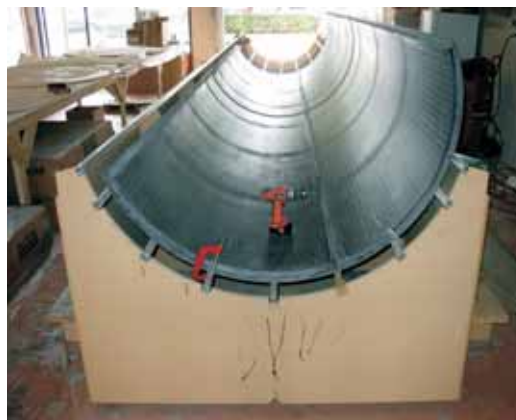
Finished panels being prepped for final assembly. The first panel joint was held in place with Cleco fasteners onto a stringer after the sheet metal had been removed.