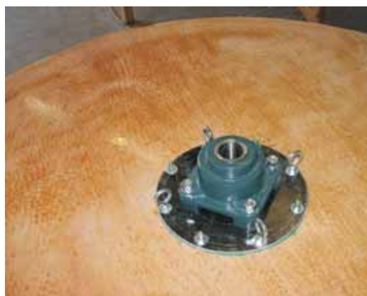
The middle bulkhead with main bearing attached. The eyebolts had cables connected to the lower bulkhead rim to carry the cylinder weight.