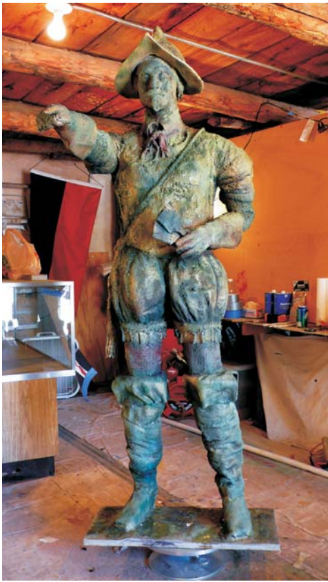
The life-sized Artistador under near completion in the studio.