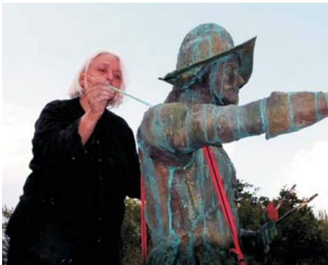
The artist applying the finishing touches to the sculpture's patina.